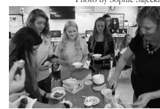
The Stampede staff celebrates the finish of this year's yearbook with ice cream and other treats during class on Monday, April 11th.

The Stampede Yearbook's staff remains determined that the tradition of excellence will continue, creating lasting memories for future students.