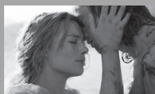
The Legend of Tarzan July 1st