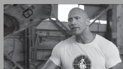
Central Intelligence June 17th