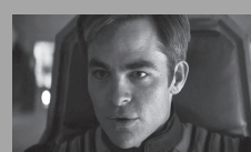
Star Trek Beyond July 22nd