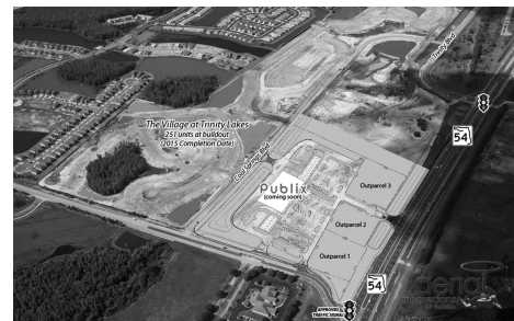
An aerial shot shows the future development of the Shoppes at Trinity Lakes which will include stores like Publix, Hot Wok, and Orange Theory Fitness.