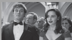
Me Before You June 3rd