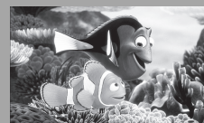
Finding Dory June 17th