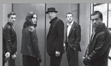
Now You See Me 2 June 10th